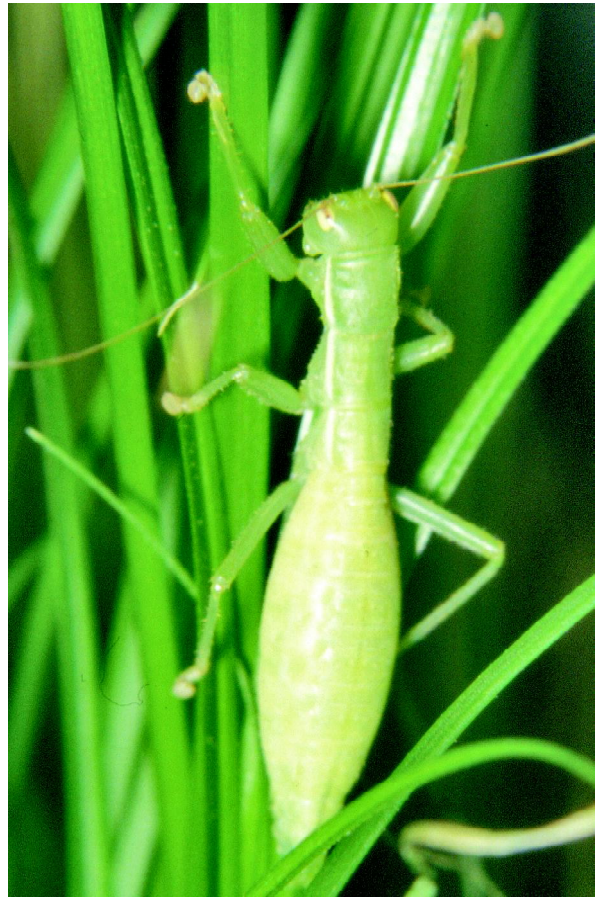
Fig. 7. Mantophasma kudubergense sp.n., ♀. © O. Zompro. Рис. 7. Mantophasma kudubergense sp.n., ♀. © O. Zompro.