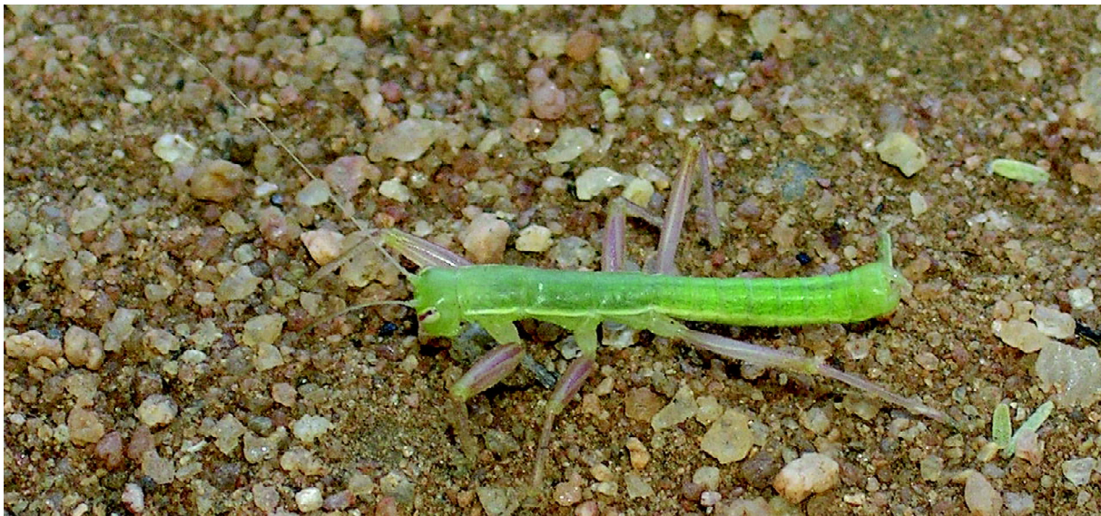
Fig. 5. Mantophasma omatakoense sp.n., holotype, ♂. © C. Grohmann. Рис. 5. Mantophasma omatakoense sp.n., голотип, ♂. © C. Grohmann.