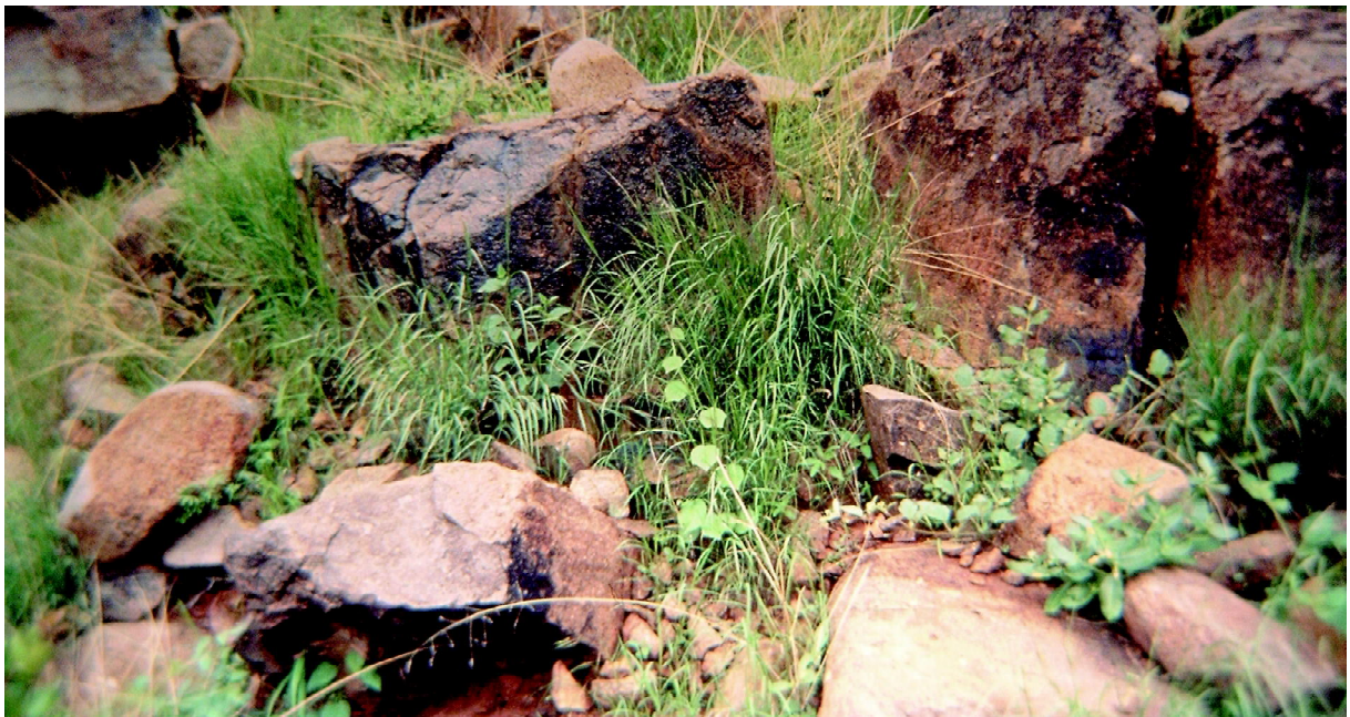
Fig. 8. Habitat of Mantophasma kudubergense sp.n. at Kuduberg. Рис. 8. Местообитание Mantophasma kudubergense sp.n. у Кудуберга.