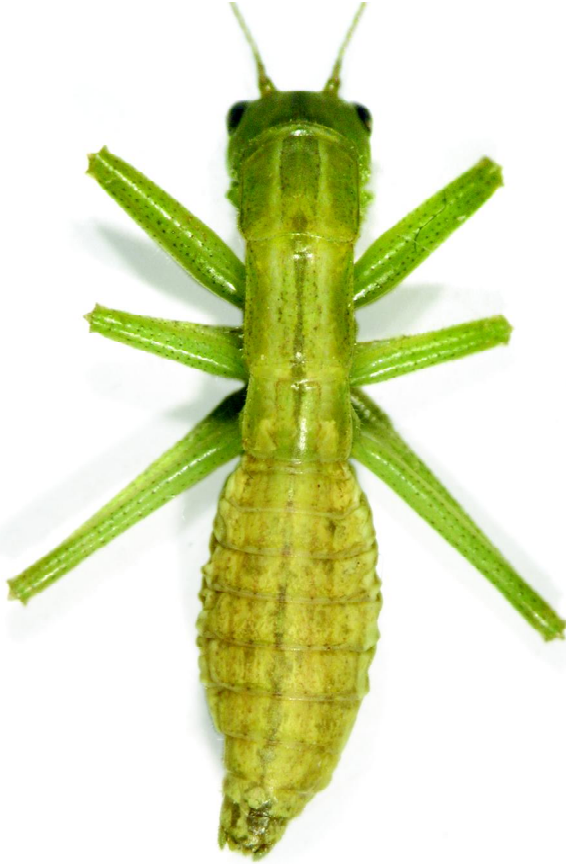
Fig. 6. Mantophasma gamsbergense sp.n., holotype, ♀. © J. Adis. Рис. 6. Mantophasma gamsbergense sp.n., голотип, ♀. © J. Adis.